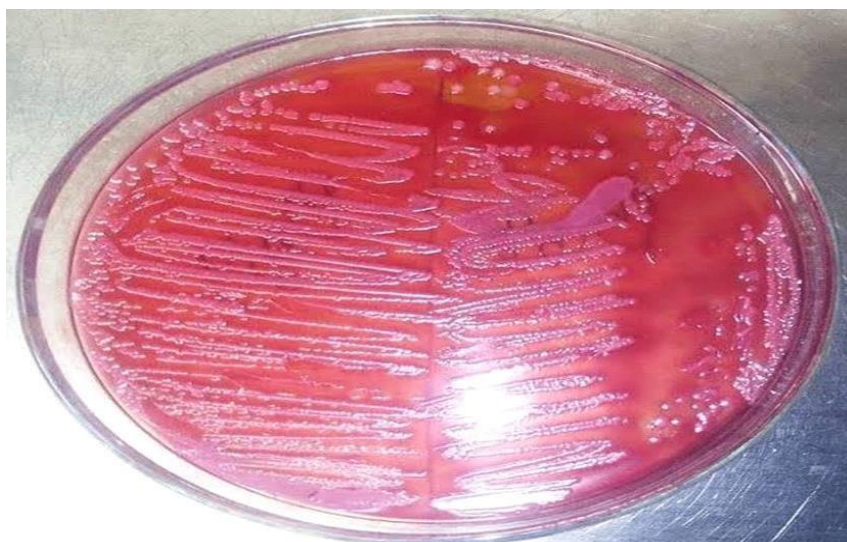
Figure 2: Microbial growth on blood agar

After biochemical analysis, all the samples were preceded for microbiological tests. The entire CSF specimens were streaked for cultivation on blood agar with the help of sterile wire loop. After streaking the petri plates were placed in an incubator at 37C for 24 hours and results were noted.