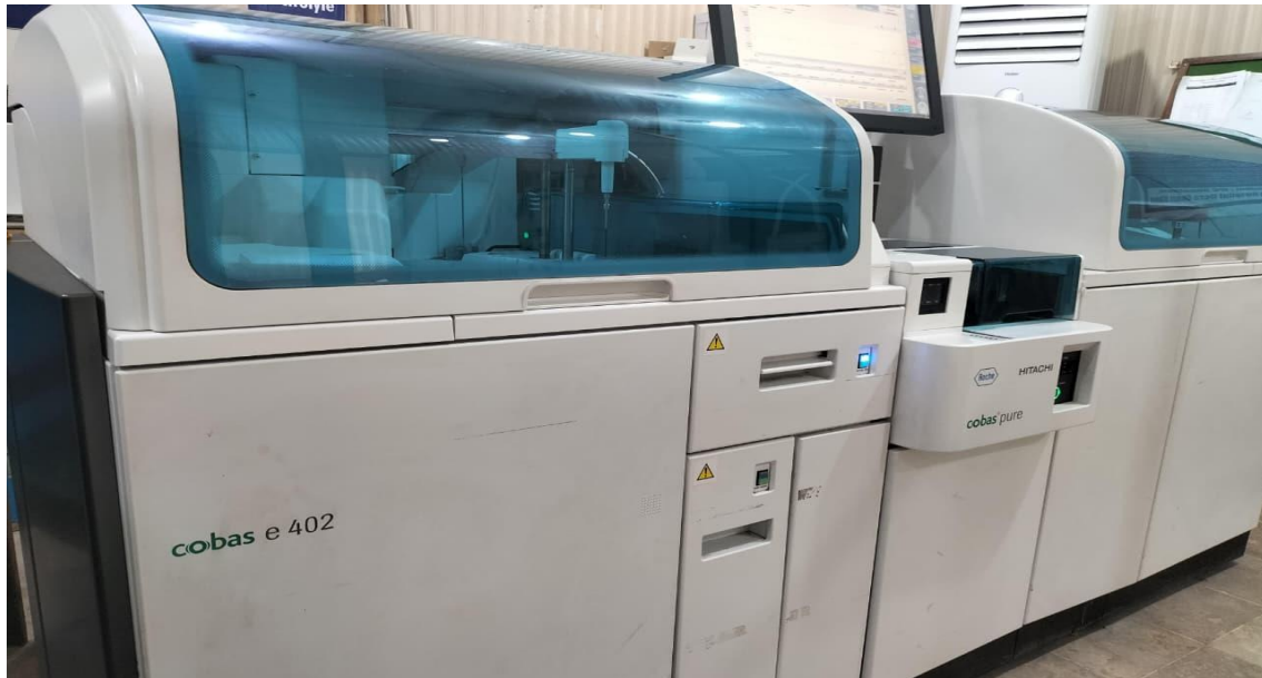
Figure 1: Biochemistry analyzer

After biochemical analysis, all the samples were preceded for microbiological tests. The entire CSF specimens were streaked for cultivation on blood agar with the help of sterile wire loop. After streaking the petri plates were placed in an incubator at 37C for 24 hours and results were noted.